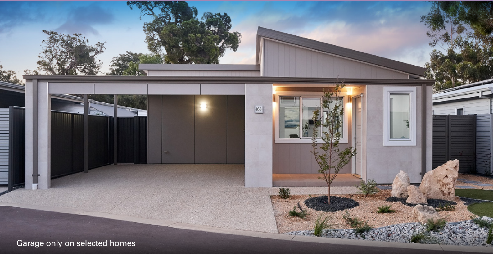
Garage only on selected homes